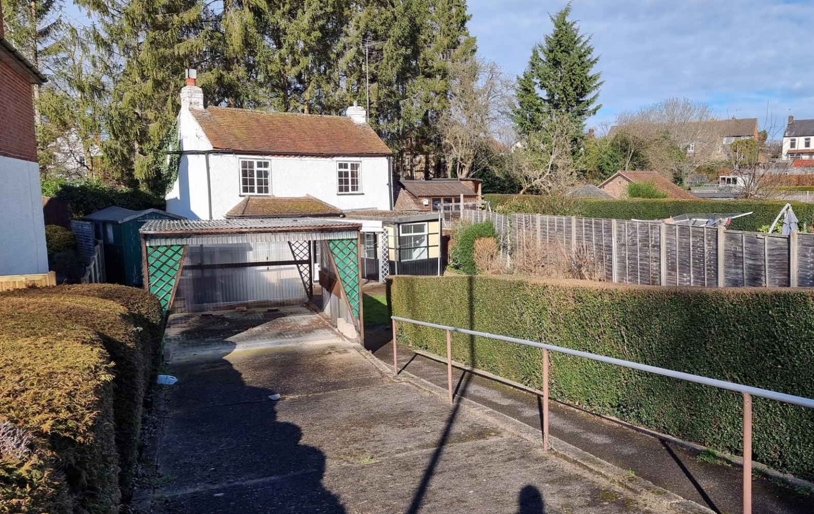
Dell Cottage, 110 Deanway, Chalfont St. Giles, Buckinghamshire HP8 4LQ